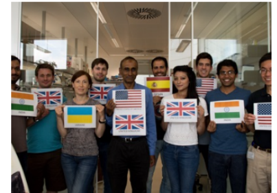
Venki Ramakrishnan and lab group

The Society has published a set of principles that should shape this future relationship and some factsheets that provide more information about why these arrangements are important for scientific research and innovation. The factsheets focus on People (PDF) , on a shared vision for European research (PDF) , and on regulation that supports research and innovation and earns public confidence (PDF) .